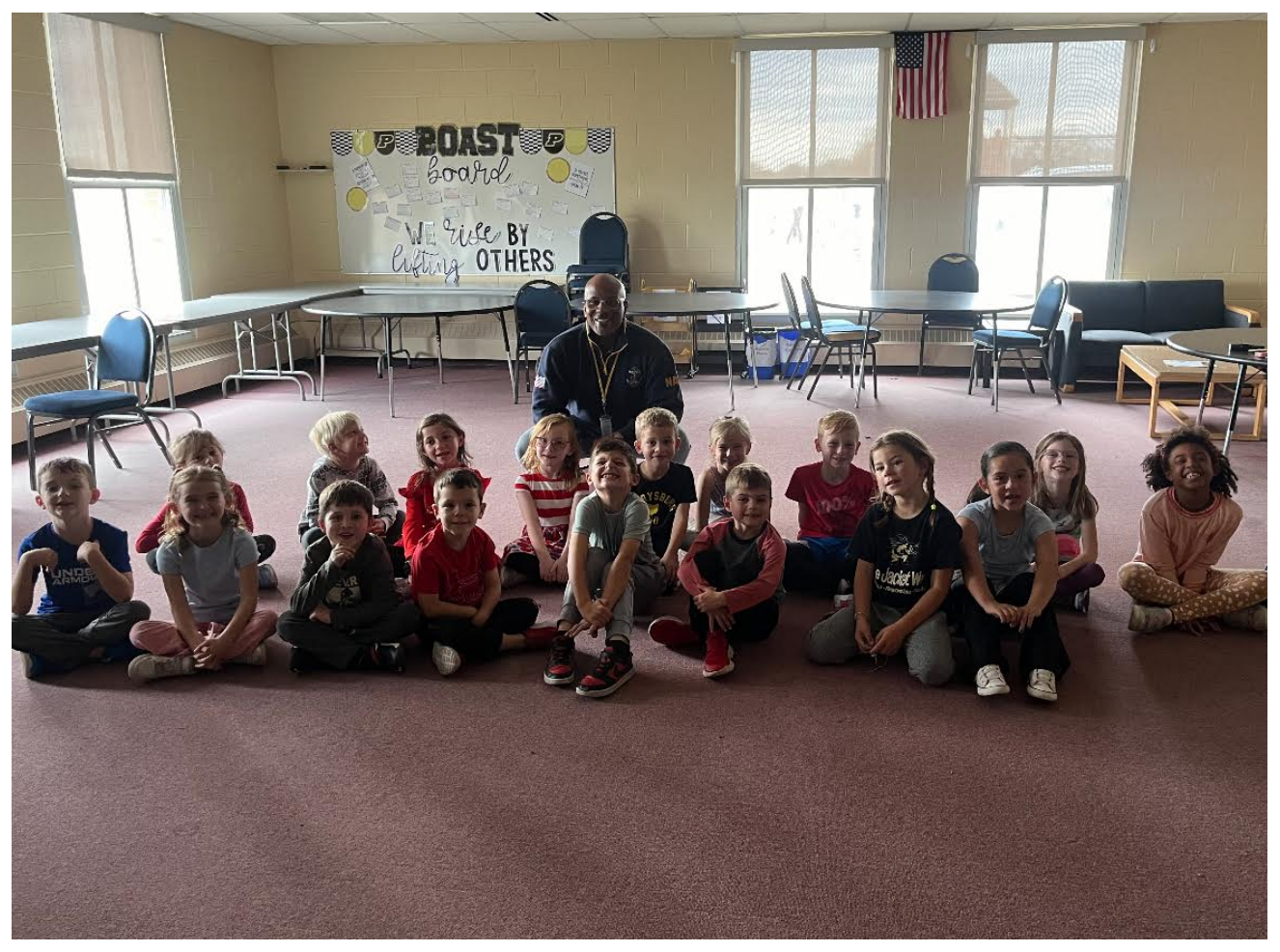
First grade had a special Veterans Day presentation from Air Force and Navy Veterans. Thank you!